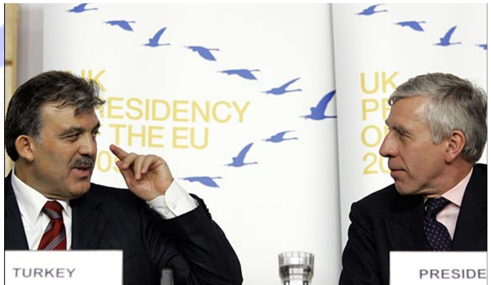
The British presidency pushed hard in October for an opening of accession talks with Turkey

But on substance some good was done. On the development agenda, many NGOs would complain that nothing was ever good enough, and certainly the Social Platform NGOs had established seven tests and decided all had been failed. But Ministers had worked hard in the run up to the G8 and EU presidencies, and Gareth Evans and Hillary Benn had been very open with development NGOs about the real possibilities. The real test would be that there would be much less action by NGOs in 2006 since so much was