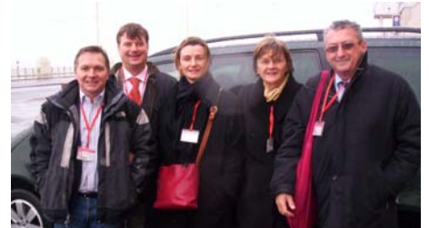
Rain from rain: Brussels Labour members acclimatising to Blackpool

Batisani explained that to see the true extent of poverty and need in Africa, it was vital to look beyond the headline economic statistics. Botswana's raw economic statistics may appear good, but the reality is that there is 35%