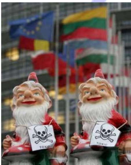
The first reading of REACH was concluded after an intense lobbying campaign