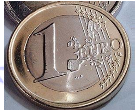
Member States eventually reached an accord on the EU's financial perspectives