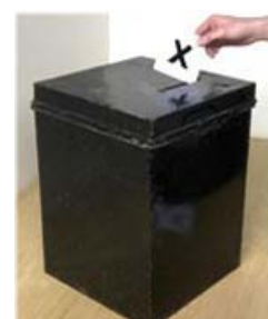
Communal elections take place in Belgium on 8 October 2006

Above all it is you - the Branch - who are responsible for our achievements. Because of you, we attract great speakers, make powerful policy submissions, and can punch above our weight.