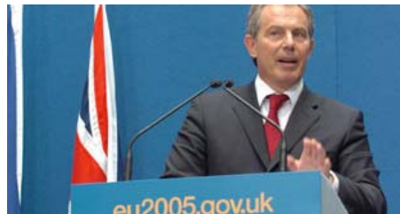
Brussels Labour's assessment of the UK presidency was fairly positive

And twelve months ago, we looked forward to a UK debate on the constitution, recognising that getting a yes vote in a referendum wouldn't be easy but that it provided the Party with a great opportunity to correct misperceptions about the European Union. We felt that the Branch could play a unique role by working through Party activists. We listened carefully to the lessons of sister parties who had held referenda - some successfully, some not so. But it was not to be. The constitution is - in effect - put to one side during a period of reflecting about how