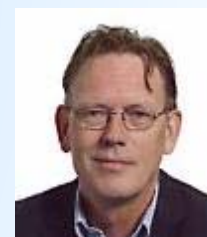
Jan Marinus Wiersma Dutch Member of the European Parliament